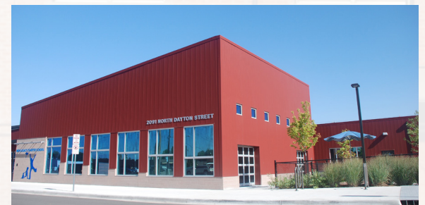
New Legacy Charter School in Original Aurora