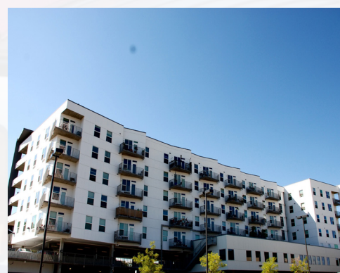
Avondale Apartments in West Denver