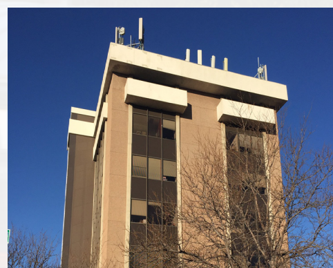
Mountain View Nonprofit Tower