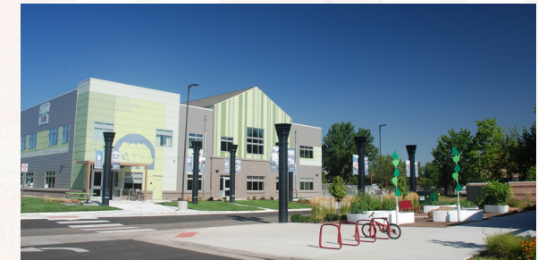
Roots Elementary at Holly Square in NE Park Hill