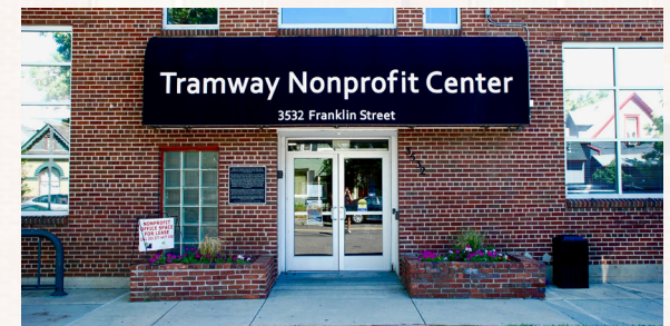
Tramway Nonprofit Center in the Cole Neighborhood