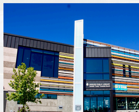
New Corky Gonzales Library at Mile High Vista