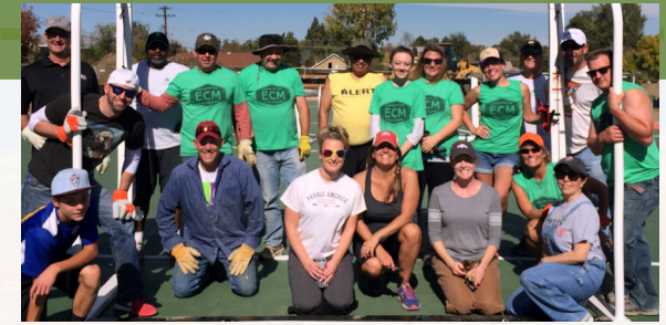
New Futsal Court in Westwood

Commerce City and Original Aurora: Building on our role with New Legacy Charter School, we will seek to take advantage of additional opportunities in these underserved communities to bring about a range of community benefits that better serve the at-risk population.